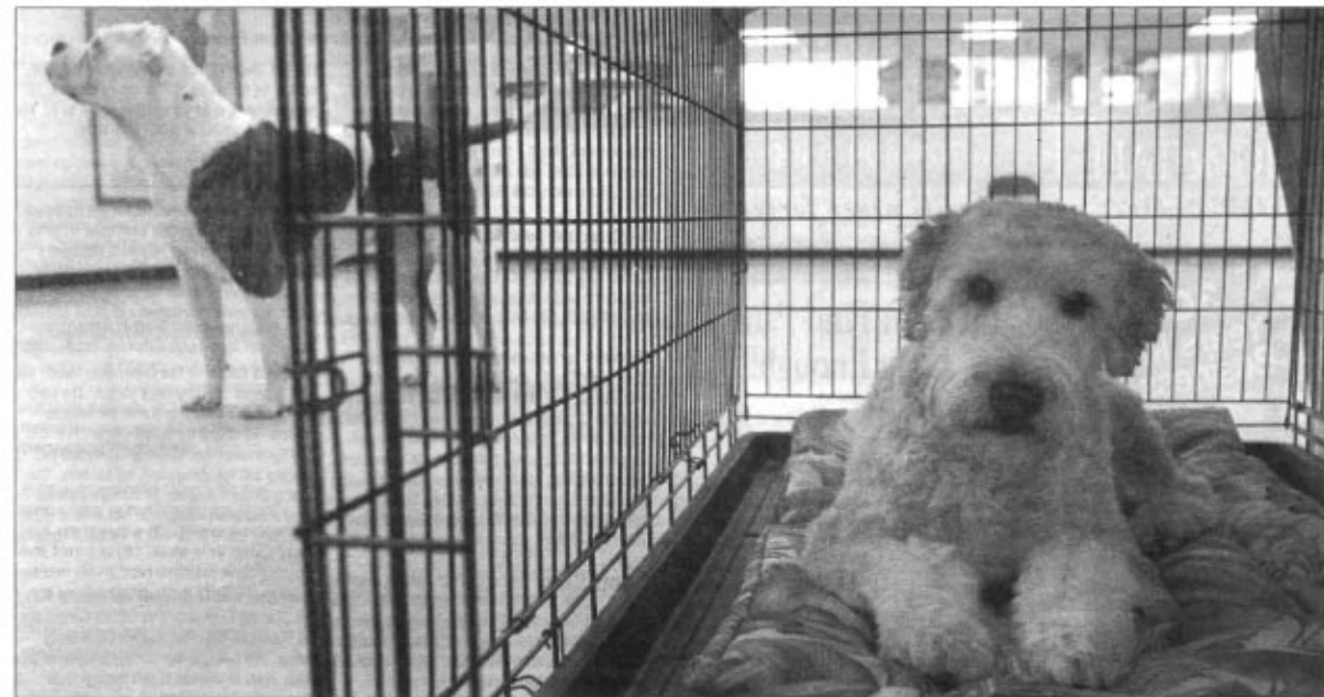
ABOVE: Bunker has taken it upon himself to stow away in a comfortable cage to rest while behind him Lexi strolls around, checking out what's happening in the playroom.